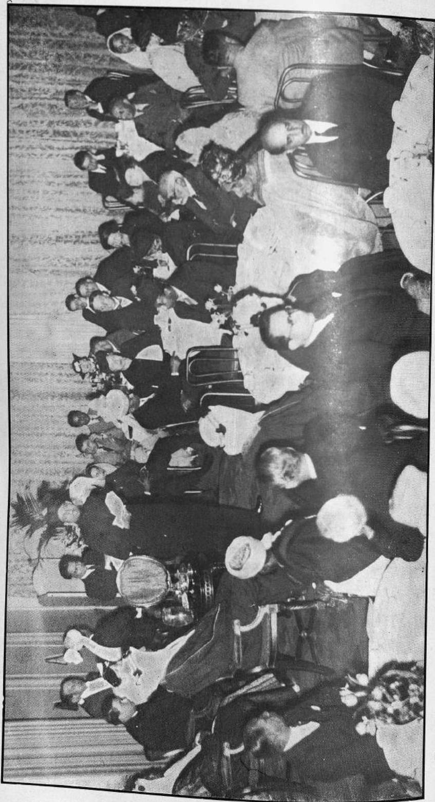
The photo shows a part of the audience near the dais that attended the reception held in honour of the birthday of the Holy Prophet Muhammad by the Muslim Society in Great Britain on Saturday, May 22, 1937, at the Grosvenor House, London, at 4-30 p.m. His Royal Highness the Amir Saud was in the chair. The full details of the occasion appear in this issue.