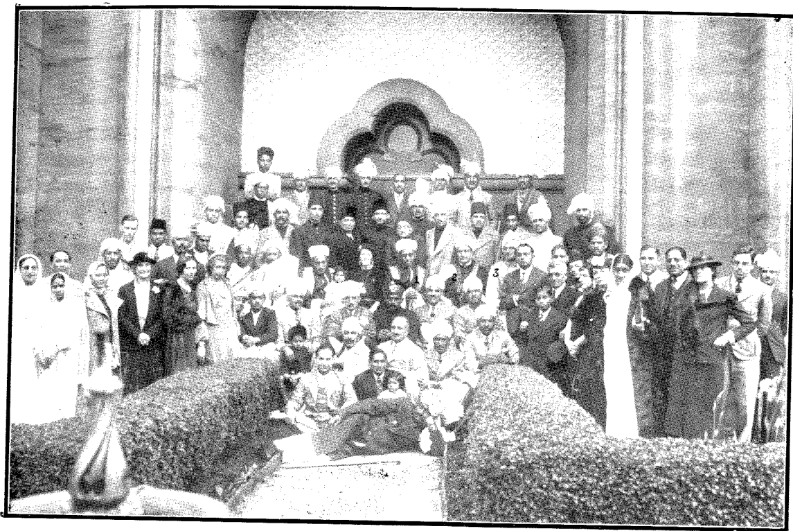
A Fraternal group taken on the occasion of A Reception given by the Imam of the Shah Jehan Mosque, Woking, on Sunday, 16th May, 37, in honour of His Royal Highness Prince Saif-ul-Islam of Yamen, His Highness The Sultan of Shihr and Mukalla, His Highness The Sultan of Lahej (marked 1, 2, 3, respectively), and officers of the Indian Contingent.